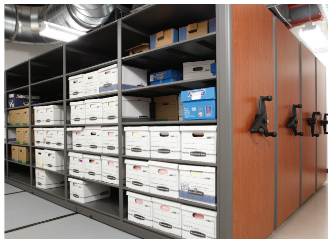
MobileTrak® storing archival boxes in an administration building