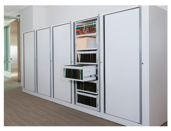
Ez2® Rotary Action File for document storage