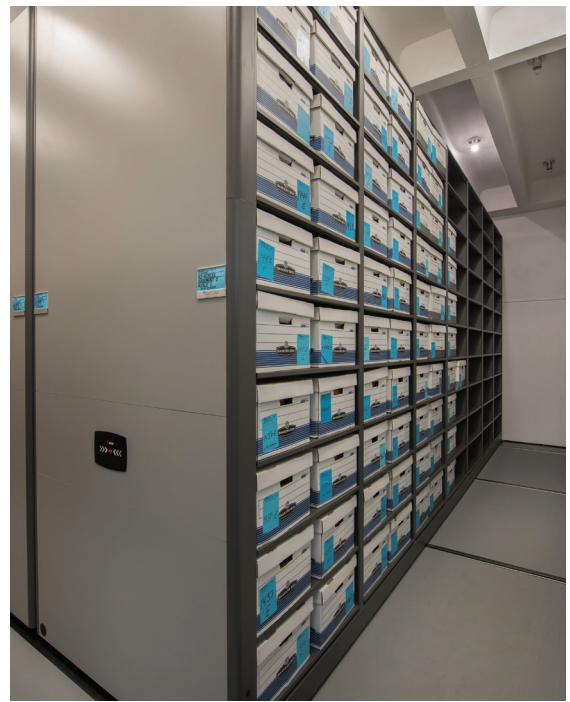
Powered MobileTrak® storing evidence boxes in a police headquarters