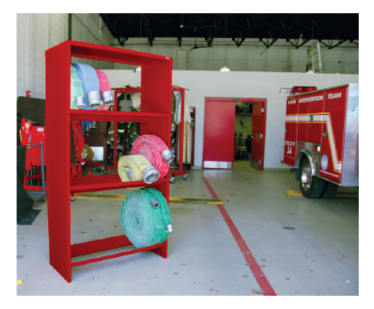
Fire hose storage using 4Post™ shelving