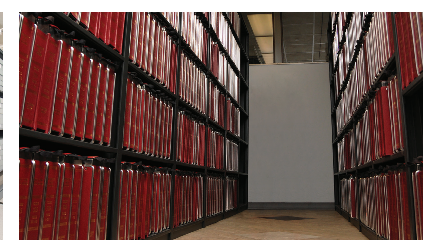
Custom 4Post<sup>™</sup> for archival library binders