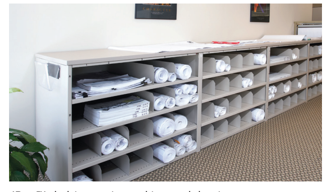
4Post™ shelving storing architectural drawings