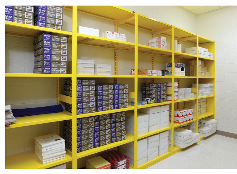
4Post™ shelving for general storage in a school