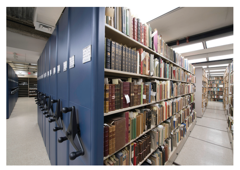
MobileTrak® system storing historical books and documents in a college library