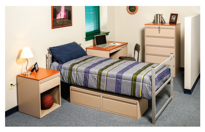
Datum® dormitory and institutional furnishings