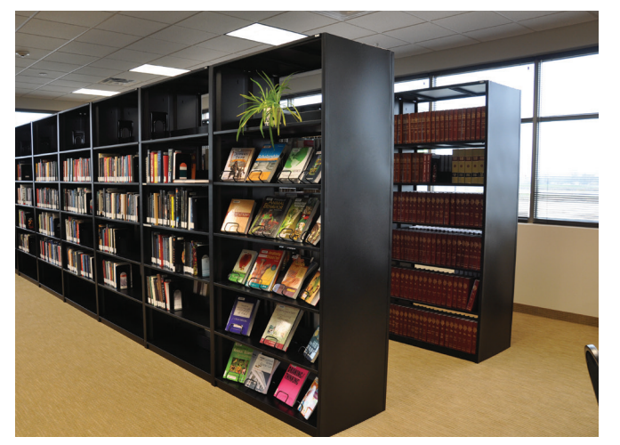
4Post<sup>™</sup> Library Shelving housing books at a university