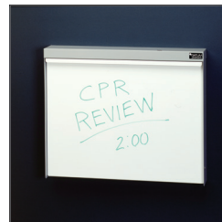
WW-101WB White Board