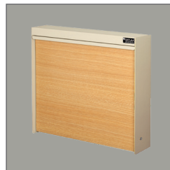
WW-101LP Laminate Panel