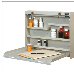
WW-400 DrugStor™ • Secures narcotics and other pharmaceuticals • Two locks can be keyed alike or differently for increased security • Four adjustable shelves on 1 3/4" increments

WallWrite® workstations are ideal for healthcare environments where placing supplies and documents closer to the point of care is vital to enhancing the patient experience. Datum offers a number of specialized workstations specifically designed for the needs of the healthcare industry that meet both HIPAA compliance and ADA requirements.