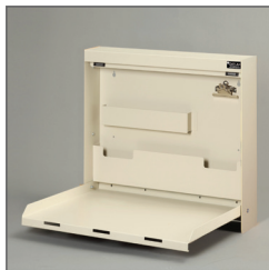
WW-102 Economy WallWrite