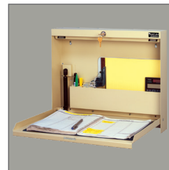
WW-100SC Self-Closing Door

WallWrite® is available in 15 standard paint colors, 12 standard laminate finishes. Custom match paint colors available. Contact the factory for more information.