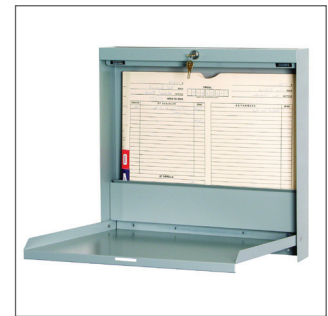
WW-100DB DropBox™ WallWrite® • Fast, easy, confidential filing • Convenient worksurface for high-traffic area • Available in x-ray and standard sizes • Available with or without lock • Slot dimensions (in.): 3/4"D x 18 3/4"W