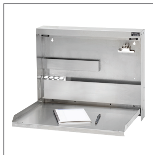
WW-103 Economy WallWrite® II • Stores oversized files or older x-ray jackets and film • Available without lock • Dimensions (in.): 19 3/8"H x 20"W x 3/38"D (Shown in stainless steel)