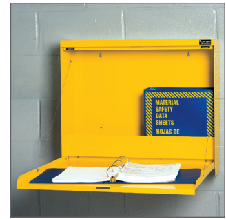
WW-301 MSDS WallWrite® • Helps meet Federal Hazard Communications Standard • Stores MSDS binders or other important reference materials • Highly visible and easily accessible • Pull-down door doubles as worksurface