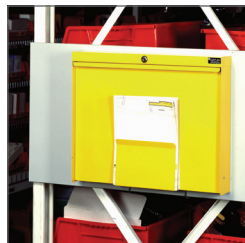
WW-100CH Chart Holder