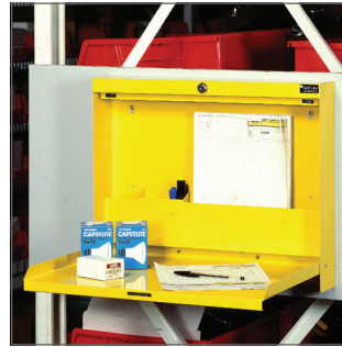
WW-100 Easily mounts to wall, column, or shelving rack.