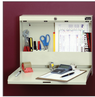
WW-100 Convenient workspace for a wide variety of tasks.

The WallWrite® wall-mounted workstation is ideal for high-traffic areas in industrial and commercial environments where temporary workspace is needed, including: loading docks, warehouses, factory floors, maintenance and supply rooms, inventory areas, public planning, shipping and receiving, and computer rooms. WallWrite can be installed virtually anywhere and can be mounted at a standing or seated height for maximum user convenience, and heavy-duty steel construction and a powder-coated finish allow it to stand up to rugged work environments.