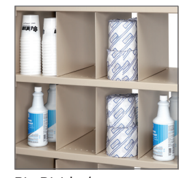
Bin Divider/ Punched Shelf