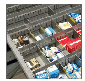
Storage Drawer Kits