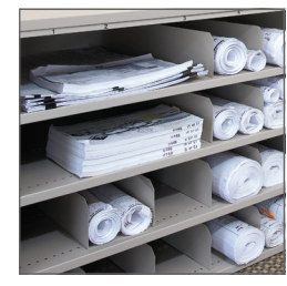
Plan Storage Dividers