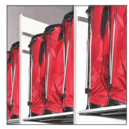
Golf Bag Storage