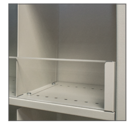
Plexi Glass Bin Front